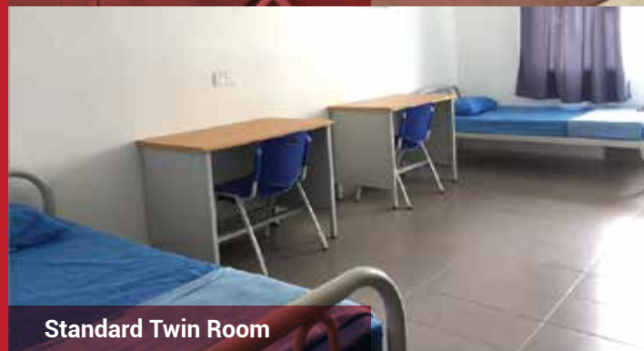
Standard Twin Room