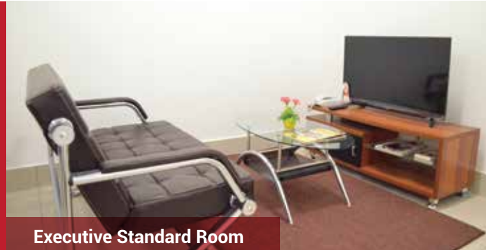
Executive Standard Room

MAHSA University offers various room types within our two blocks of Residences to suit your budget. They range from single en-suite, twin-shared to four-shared rooms with or without air-conditioning. Residence blocks are within campus grounds, ensuring 24-hour security with easy access to on-campus conveniences for retail, food and beverage, indoor and outdoor sports and leisure facilities.